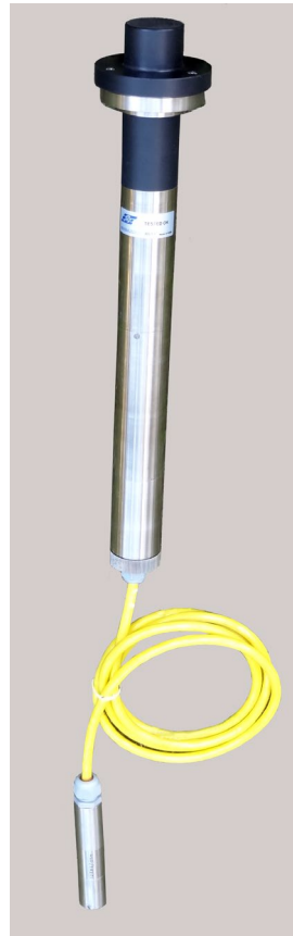
Figure 1 A typical water level sensor (bottom) connected with signal cable to the datalogger with cellular phone telemetry module (top) for installation inside boreholes.

For pressure sensors with a measuring range of over 50 mwc the effect of change in atmospheric pressure is much less than the accuracy rating of the pressure sensor so generally gauge pressure sensors are not used for measurement ranges over 50 mwc.