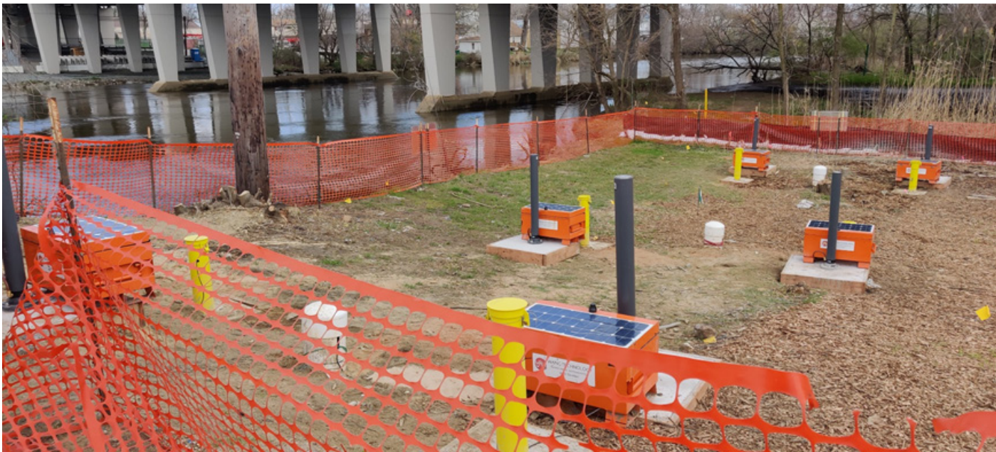
Figure 2 Instrumentation layout at the site

Monitoring of the above mentioned instruments has been executed successfully, giving the client necessary information required for smooth progress of the project. The project had very rigorous triggering limits to closely monitor the impact of construction activities on the Christina River Force Main (CRFM) concrete sewer pipe.